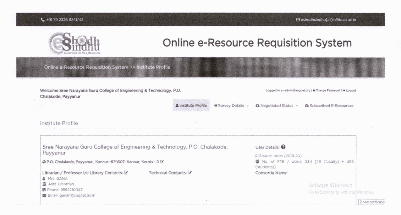
Fig. 1 Screenshot of e-Shodhu Sindhu

The main objective of the e-ShodhSindu: Consortia for Higher Education E-Resources is to provide access to qualitative electronic resources including full-text, bibliographic and factual databases to academic institutions at a lower rates of subscription.