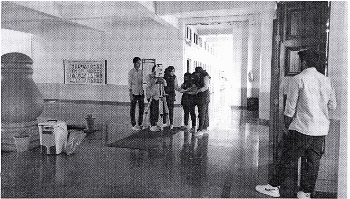
Total station Workshop